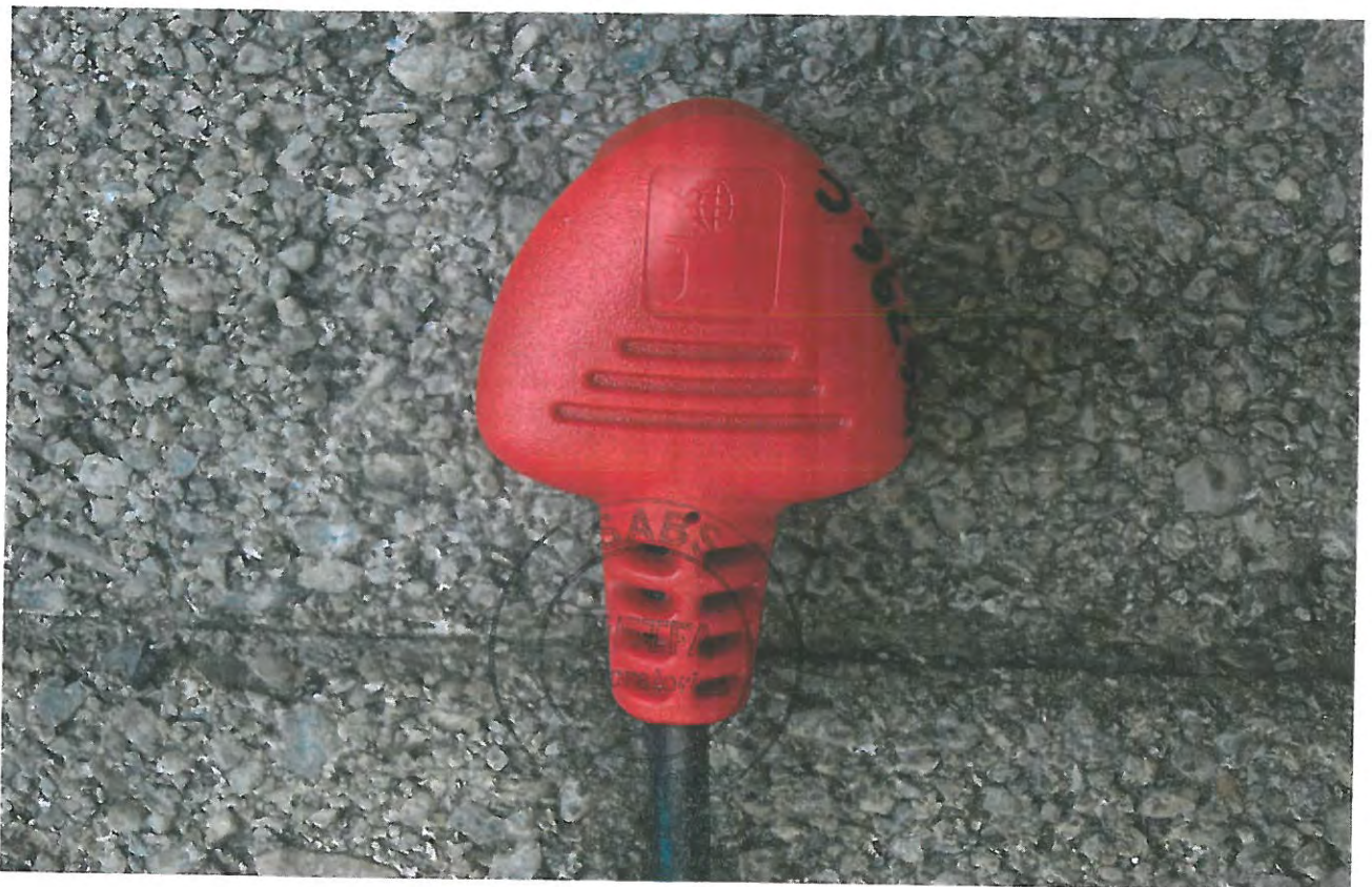
Photograph No. 2 Bottom view of the sample