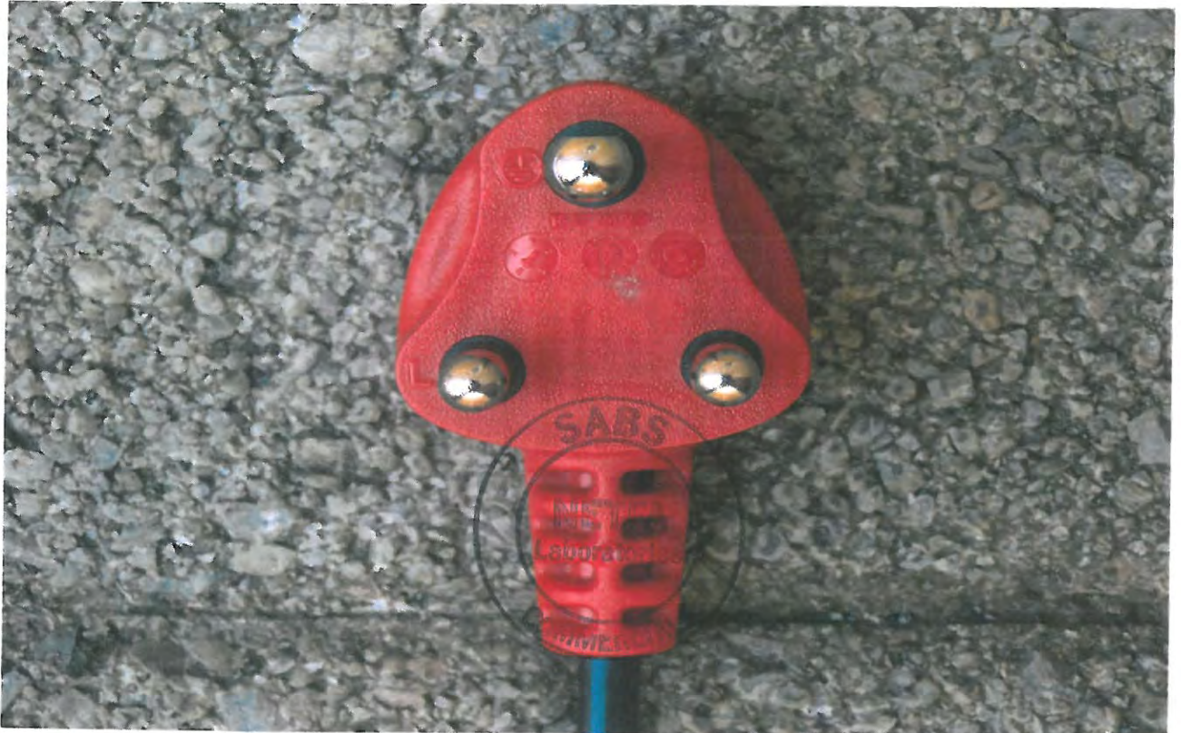
Photograph No. 1 Top view of the sample